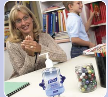
On the teacher's desk