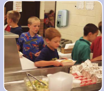
In the cafeteria